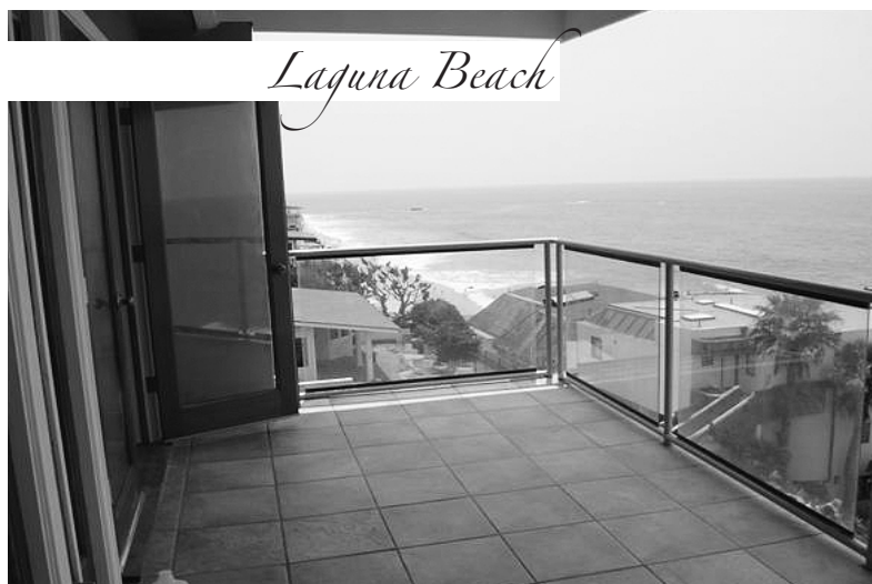
Oceanfront penthouse apartment all new upgrades with fireplace, hardwood floors, and granite counters. 3bd, 2ba with private deck, underground parking. Offered for lease $4,950 monthly